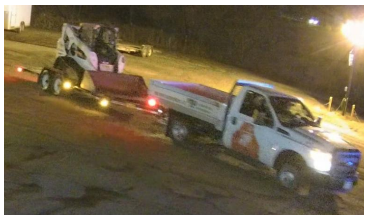
Home Depot truck towing trailer and Bobcat Loader