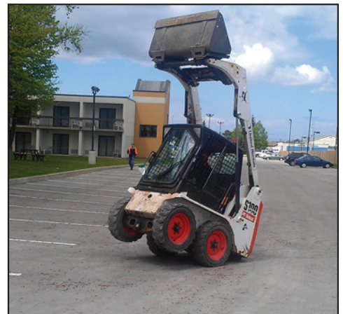
NER Analysts demonstrate heavy equipment operation to law enforcement officers.