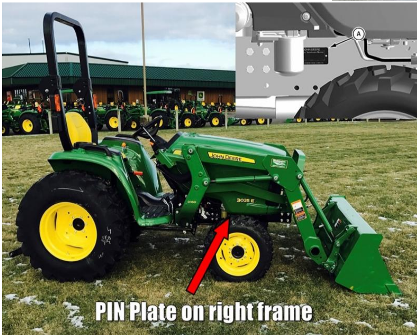
PIN Plate on right frame

Pictured is an example image of a Deere 3025-E. The Tractor PIN plate is on the right frame, inset from the front wheel and partially obscured by the lower engine cover panel.